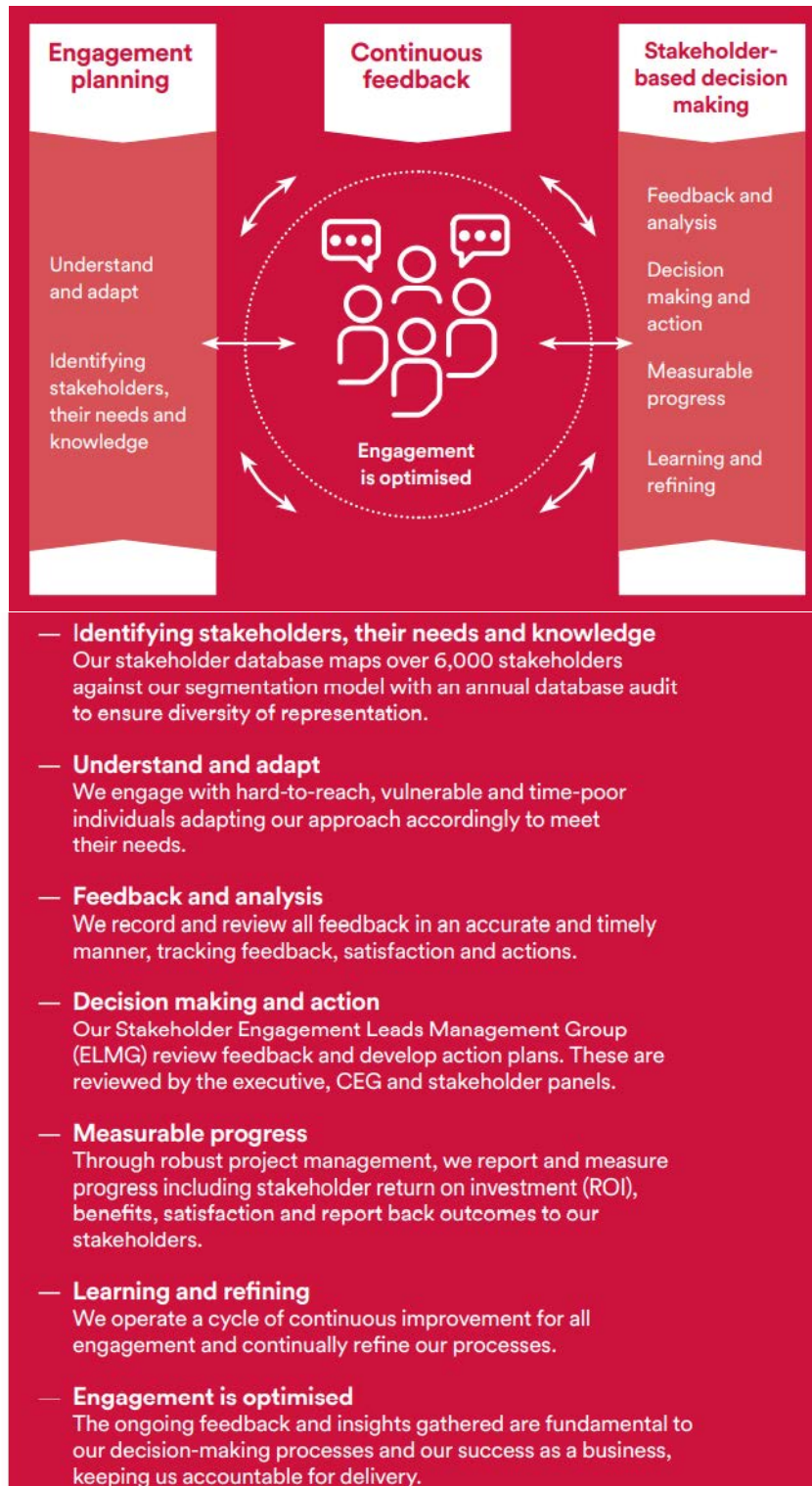
Figure 2 – Stakeholder engagement cycle